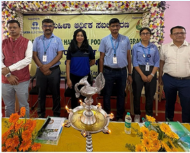
Bandhan Konnagar signs MOU with TATA Electronics in Bengaluru